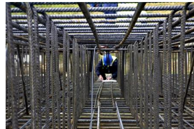
Diaphragm Wall Reinforcement