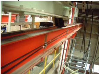
Crane Girder Deflection