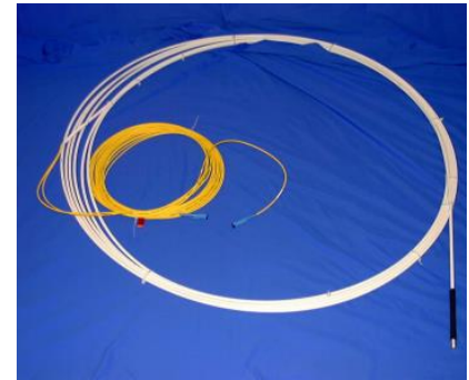
50 m Riser Curvature SmartRod

SmartRod comprises a composite pultrusion into which one or more arrays of FBG strain sensors are installed so as to measure the local (short gauge) or average (long gauge) strains within the pultrusion.