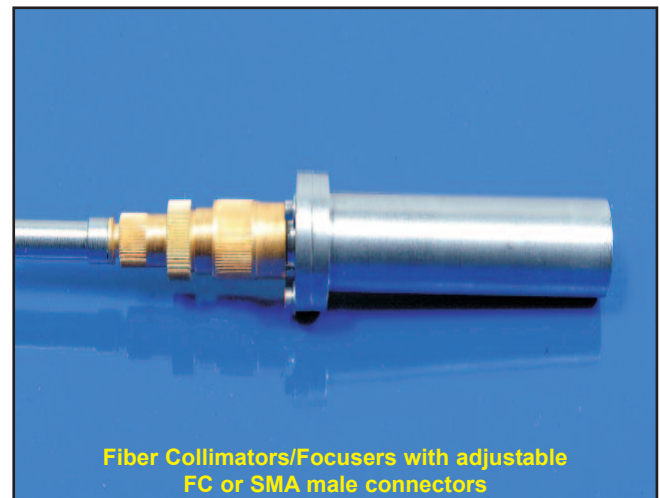
Fiber Collimators/Focusers with adjustable FC or SMA male connectors