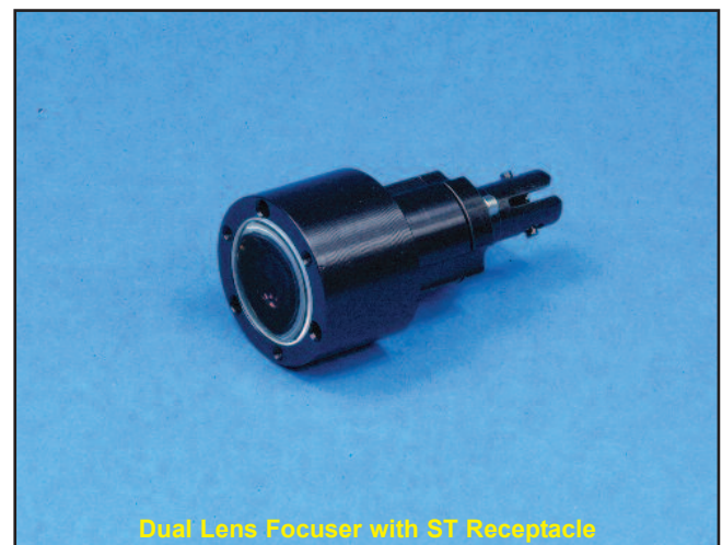
Dual Lens Focuser with ST Receptacle