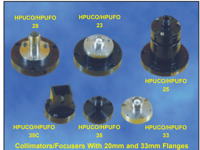
Collimators/Focusers With 20mm and 33mm Flanges

OZ Optics standard tables list the definitions used for each fiber type, as well as conversion factors to convert values to 1/e^2 values. OZ Optics uses 1/e^2 definitions for its calculations of the beam diameter wherever possible.